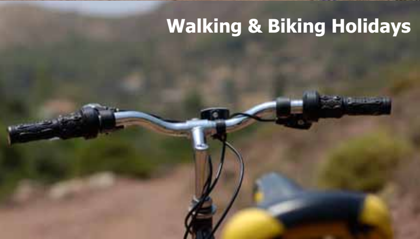
Walking & Biking Holidays