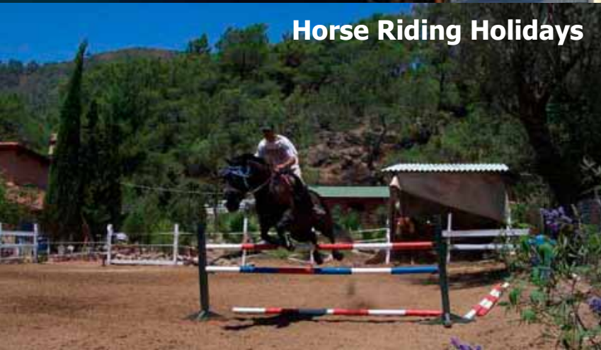
Horse Riding Holidays